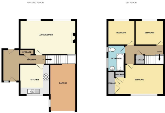
3 WELDBANK CLOSE, CHILWELL

Whilst every attempt has been made to ensure the accuracy of the floorplan contained herein, measurements of plots, buildings, rooms and any other items are approximate and no responsibility is taken for any error, omission or misstatement. This plan is for illustrative purposes only and should not be used as such for any other purpose.